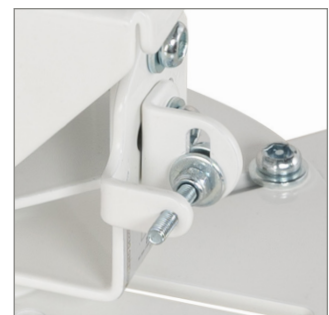
Micro-adjustment feature is ideal for short throw projectors