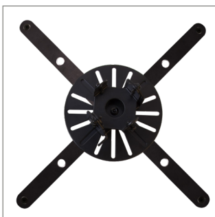
Unique 'carousel' mounting plate for universal compatibility