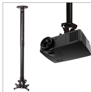
Compatible with B-Tech System 2 poles and ceiling mounts